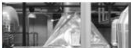
Industry ENEA - Italy