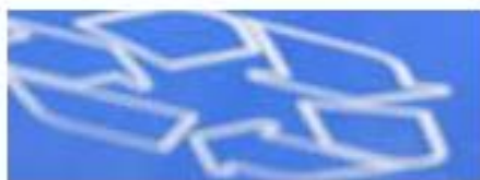
Labelling & Ecodesign EST - UK