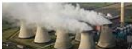
Energy Efficiency CRES - Greece