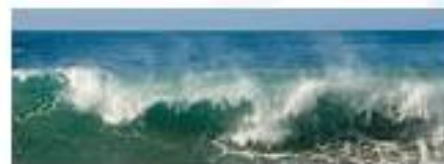
Renewable Energy Dena - Germany