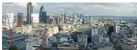
Buildings ADENE – Portugal