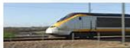
Transport EST - UK