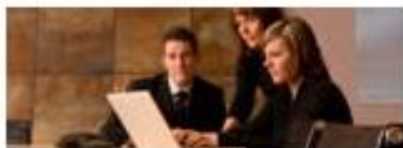
Monitoring Tools ADEME - France