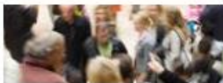
Behaviour Change Motiva Oy - Finland